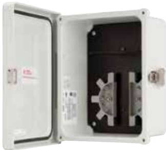
Harsh Environment Enclosures