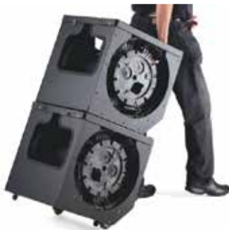
MARS Reels in Cartridge System