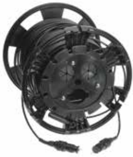
Plug-to-Plug Cable Assembly on OCC MARS Reel