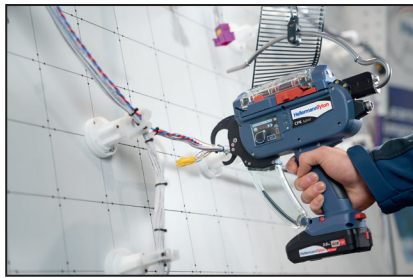
Operated by battery with cable ties on a reel from overhead suspension