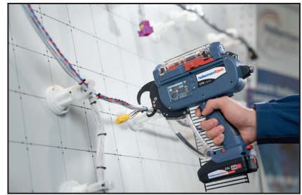
Operated by battery with cable tie bandolier