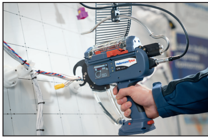
Operated by power supply

You have the choice: cordless operation with rechargeable battery pack, corded with AC power, or a combination of both.